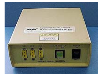
MSC300U Thermo profile Checker