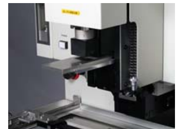
SND-ADP Jig set Up